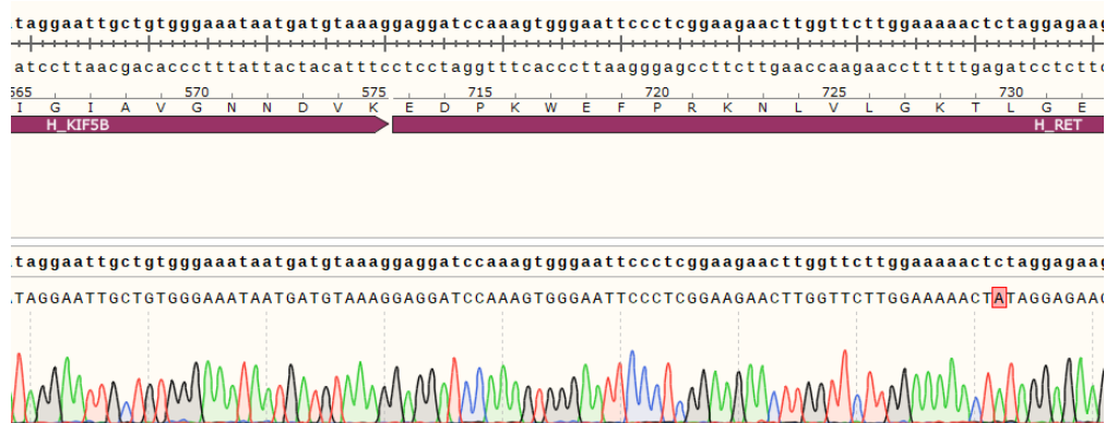
Figure 2 | The KIF5B-RE mutation analysis by Sanger sequencing.